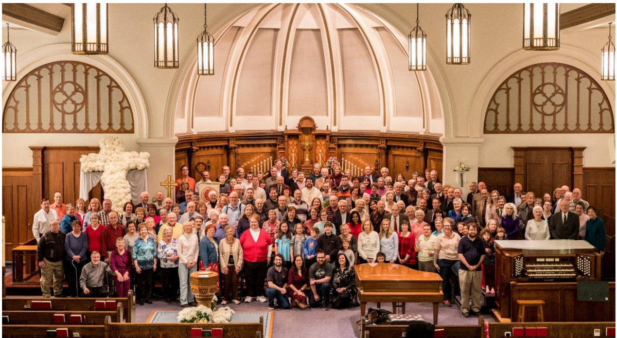
First-ever UPG Congregational Photo!