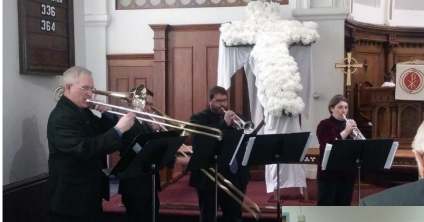
Special music during worship by The Little Brass Band of the Lehigh Valley

Thanks to all who provided food and delicious desserts